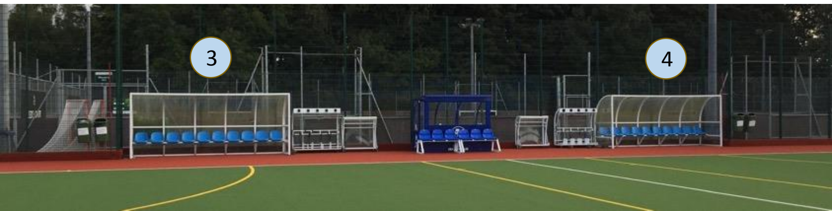
4. Away Team Dug Out